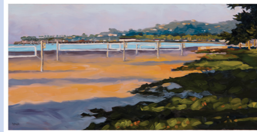
FRIENDS OF EAST BEACH ASSOCIATION SANTA BARBARA • CALIFORNIA